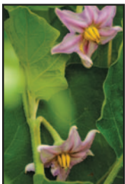
Eggplants are blooming in the Trinity garden.