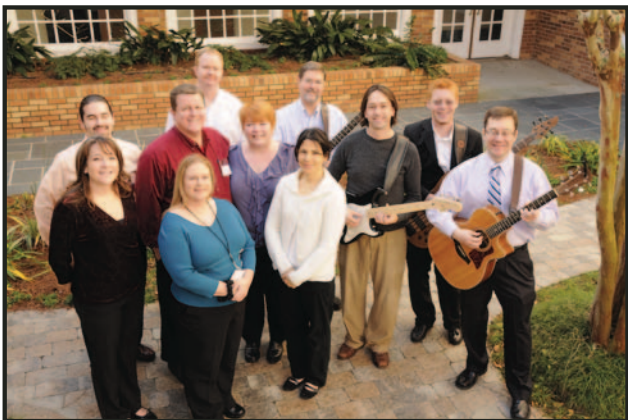
The Circle of Friends band leads the SUN Service.

Circle of Friends is an audition only group