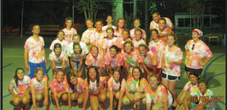
and the senior-high group had a great time too;