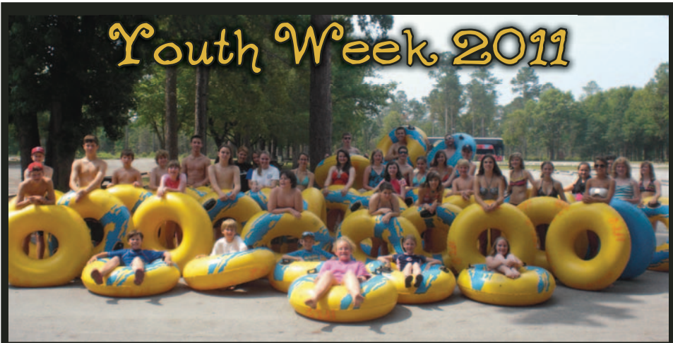
During Youth Week, the youth ... all went tubing on the Ichetucknee River;