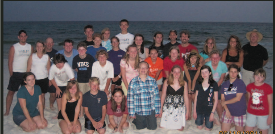
and, to finish it all off, everyone went to Panama City Beach for some fellowship and fun!