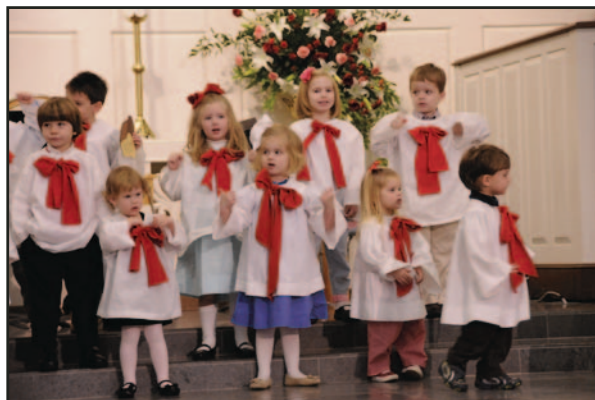
The Cherub choir is always a hit when they perform.