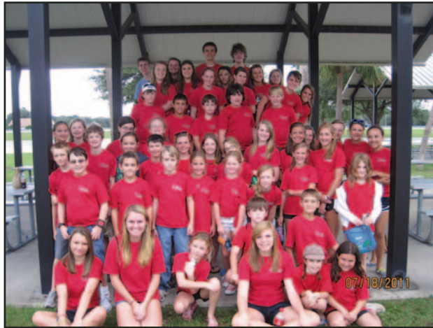
There were 52 kids who participated in Summer Camp this year. Wow!

I first want to thank all the parents and volunteers for their help this summer. It has been a very busy one and John and I could not have done it without you. Your dedication and willingness to give of your time and energy is greatly appreciated. Youth Week was an amazing week filled with lots of activities and 77 youth. We could not have pulled it off without our 28 parents and volunteers who helped that week. It was awesome and one of our best scavenger hunts, messy games, and beach retreat