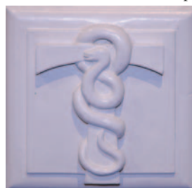
The "Tau Cross" on the lecturn.

we should first recognize the power of ritual as symbolic action. Worship is what some call "primary theology," that is, a ritual of worship speaks to us about God and about ourselves more powerfully and more fundamentally than any Sunday school lesson or theology textbook ever could. Thus questions and controversies about our worship rituals are often best approached from the viewpoint of theology, not solely from practical or aesthetic viewpoints.