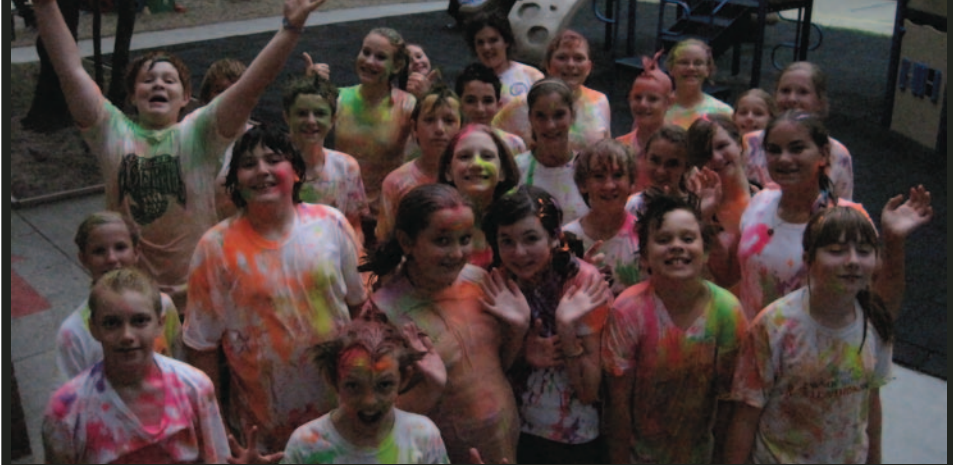
the mid-high group had an awesome messy games night;