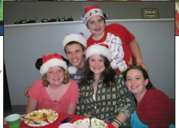
The many faces of the Trinity Youth - shown here celebrating Christmas in Moor Hall - with over 60 kids. Merry Christmas and Happy New Year!