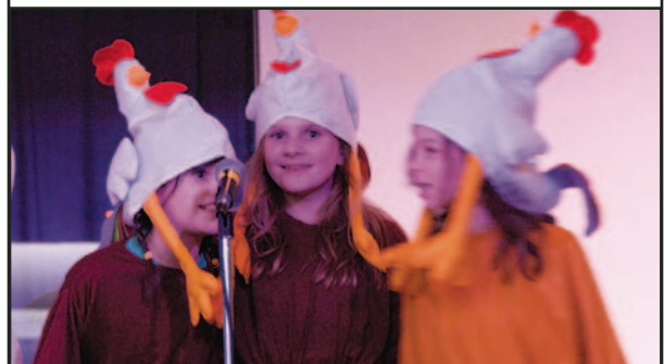
The chickens in the short play, "Sleepover at the Stable" were a bit, bit, bit!

The new year is a perfect time to sign up your children! Contact Barbara Hynes for more information (222-1120).