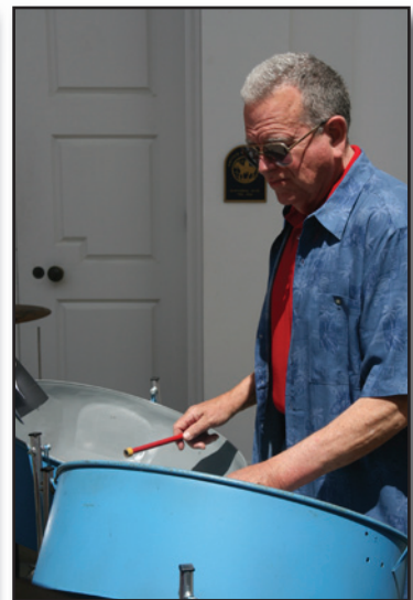
Members of the Trinity steel bands, “Pans of Praise” and “Sacred Pans,” performed at the Springtime Tallahassee celebration.