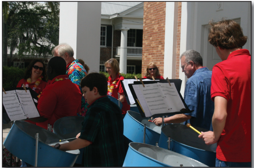
Onlookers enjoyed the unique tones produced by the Trinity steel bands at Springtime Tallahassee.

One aspect of the workshop presented by the drama group Friends of the Groom in February was how to prepare and present a scripture tableau. February 19, during the worship services, “Crossing the Red Sea” was presented as a scripture tableau. Our first through fifth grade Sunday School children have been preparing one of their own! We present it during the SUN Service on June 3. It tells the story of Jesus calming the storm while in a boat with some of his disciples. Of course there is a song that goes with it. It begins with “Peter was rowing across the lake while Jesus was sleeping in the boat.”