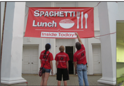
The new banner for the Spaghetti Lunch.

So, 5 years later I'm still here and have loved getting to know our youth here at Trinity. I've said it a million times, our youth are amazing and I couldn't imagine working anywhere else. I love this church, our youth, our parents, and our volunteers. We have a good thing going here at Trinity and I am so fortunate to call this place home. Just because my own children are heading off does not mean I am heading off too. I still have lots of energy left in me to keep on leading this youth group and I look forward to everything we will do in the future. I wouldn't want to be anywhere else.