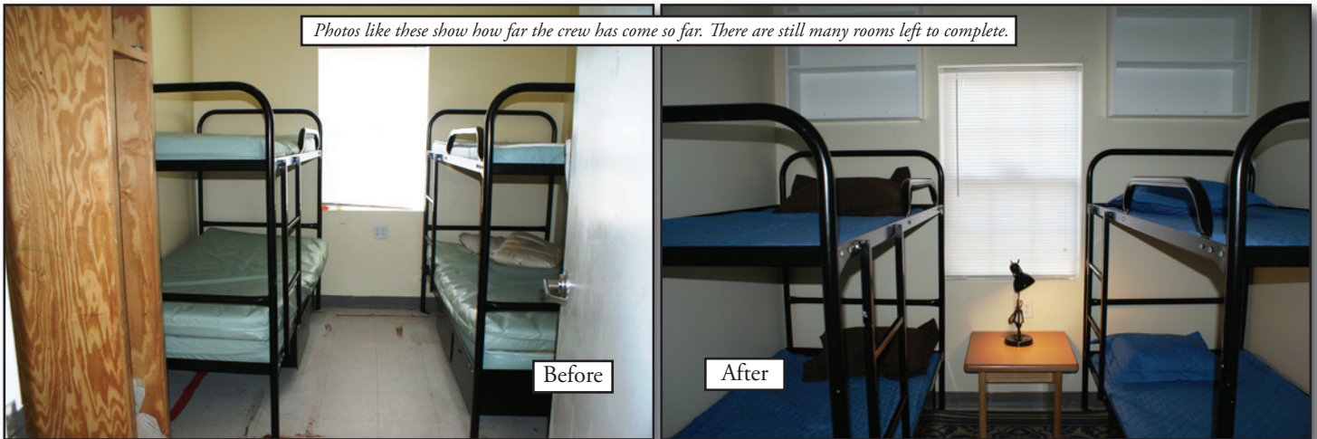
Photos like these show how far the crew has come so far. There are still many rooms left to complete.