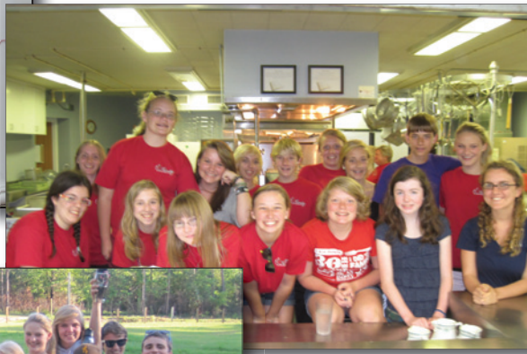
In the photo above, the Youth are ready to serve spaghetti during Springtime Tallahassee. At left, those who participated in the 30-Hour Famine worked at Centenary Camp. In the photo below, Mid-High Madness drew an enthusiastic group of Mid-High youth!