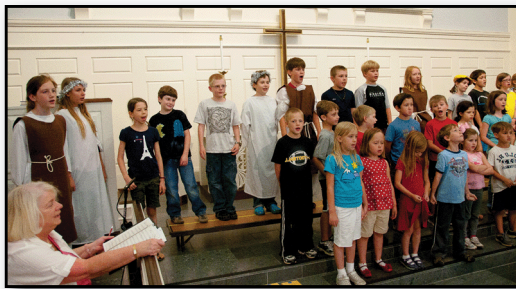
The NETkids choirs practice for their yearly performance.

• For starters, we offer NETkids Choirs for children, kindergarten through 5th grade,