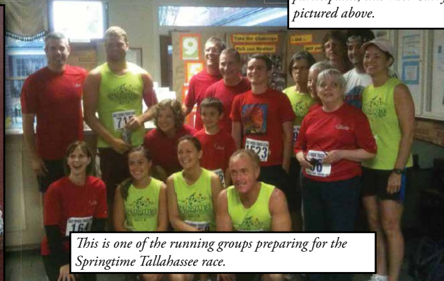
This is one of the running groups preparing for the Springtime Tallahassee race.