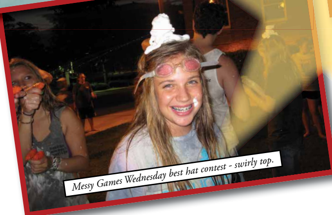
Messy Games Wednesday best hat contest - swirly top.