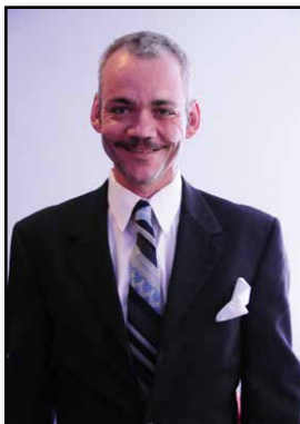
Happiness is finding your size at the Clothing Connection! This gentleman came in looking for a suit so he could be more presentable for job interviews. This is why we do it!