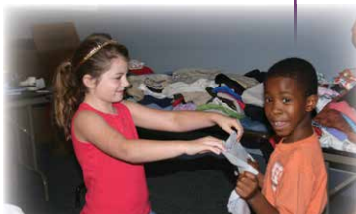
Helping each other is also why we do it!