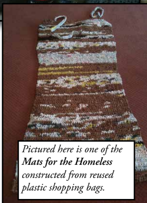
Pictured here is one of the Mats for the Homeless constructed from reused plastic shopping bags.