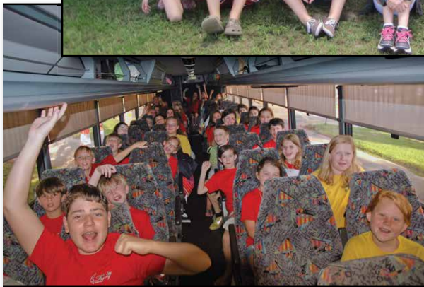
In the photo above, have a look at all of the kids from Trinity attending Summer Camp in Leesburg! Thank you, so much, for your support of this wonderful ministry. In the photo at right, seniority has its privilege! The older youth get a ride to camp in a semi-private coach - which is just fine for the kids pictured in the photo to the left - woohoo - bus trip!