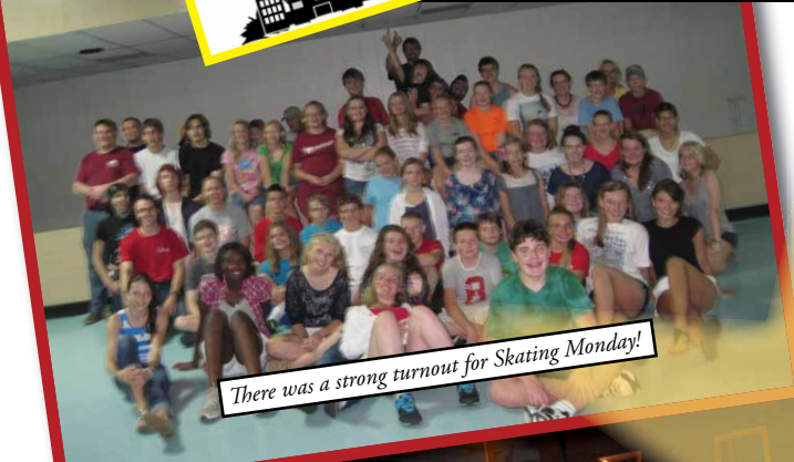
There was a strong turnout for Skating Monday!