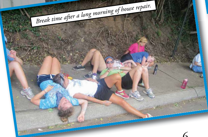
Break time after a long morning of house repair.