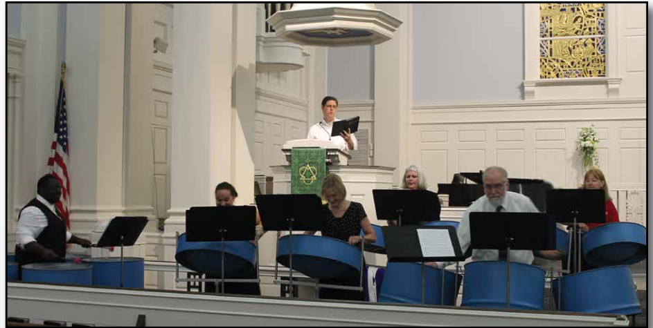
The two steel bands; Pans of Praise, and Sacred Pans, perform regularly in worship and on the road.

• Youth Choir is for middle school and high school students, starting Sunday, August 26, 5:00-6:00 p.m.