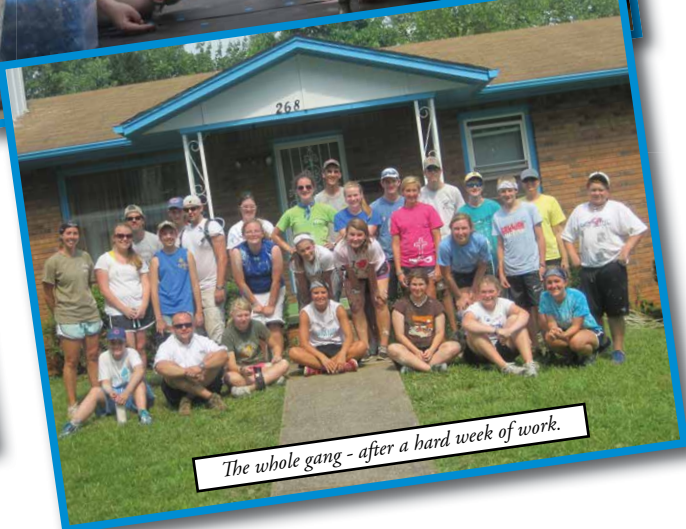
The whole gang - after a hard week of work.