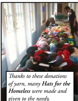
Thanks to these donations of yarn, many Hats for the Homeless were made and given to the needy.

On September 2, 2012 the Health Wellness Ministry will celebrate 4 years of service at Trinity. What started out as the BFC (Becoming Fit at Church) Series Exercise program blossomed into a service oriented Health Wellness program. Take a look at just some of what was accomplished in year number 4!