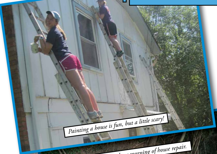
Painting a house is fun, but a little scary!