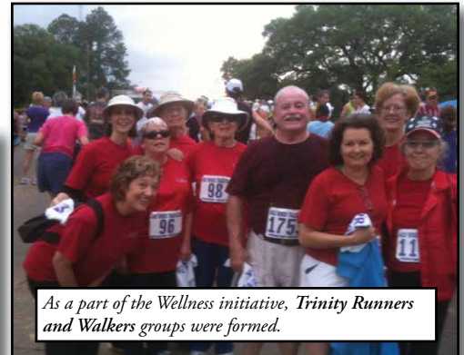
As a part of the Wellness initiative, Trinity Runners and Walkers groups were formed.