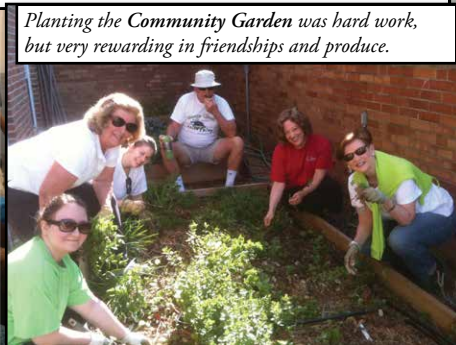
Planting the Community Garden was hard work, but very rewarding in friendships and produce.