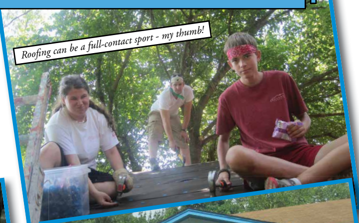
Roofing can be a full-contact sport - my thumb!