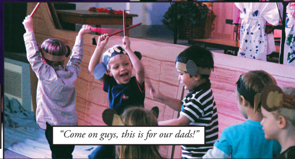
"Come on guys, this is for our dads!"

The preschool kids put on a great show for their dad's at the Dad's Breakfast. Using the theme of Noah's Ark, the kids portrayed the animals on the ark - each group with a different song, a dance, or some just made funny sounds. So cute!