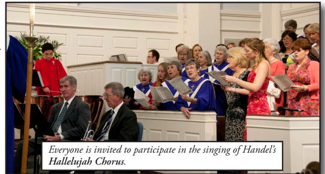
Everyone is invited to participate in the singing of Handel's Hallelujah Chorus.

We have a tradition here at Trinity of singing Handel's magnificent "Hallelujah Chorus" at the end of the 8:30 and 11:00 a.m. services. Last year, seems we had more members of the congregation come to the chancel to sing with the choir than usual. Hope that continues this year.....come join us!