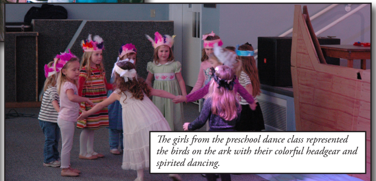
The girls from the preschool dance class represented the birds on the ark with their colorful headgear and spirited dancing.