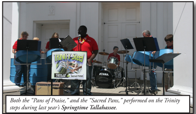
Both the "Pans of Praise," and the "Sacred Pans," performed on the Trinity steps during last year's Springtime Tallahassee.

Our two pan groups have not participated in worship services since Music Ministry Sunday, February 3 for good reason. They are preparing for Springtime Tallahassee! On Saturday, April 6, they will present a 35-minute concert on the front steps of our sanctuary. The program will start shortly after the parade is over, which means around 12:15 p.m. This is an outreach of the music ministry at Trinity and only our second year of participation. If you are in the area, come check us out and show your support! About half the program is sacred music ("Kum-Ba-Ya", "When the Saints Go Marching In", "Amazing Grace", "Amen Siakudumisa" and "Open the Doors". The other half consists of more traditional pans repertoire including "La Bamba" "Banana Boat Song", "Volcano" and "Jump in de Line".