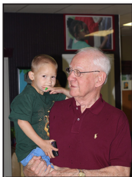
The author found a new friend at Hope Community

Priority # 1 is the laundry room. Of the three washer/dryer units needed to serve approximately 35-40 residents, there is only one, often-repaired, washer and dryer in working condition. The cost new for a washer/dryer unit each runs $1240. All eight sleeping rooms, four bathrooms the laundry and public areas need painting.