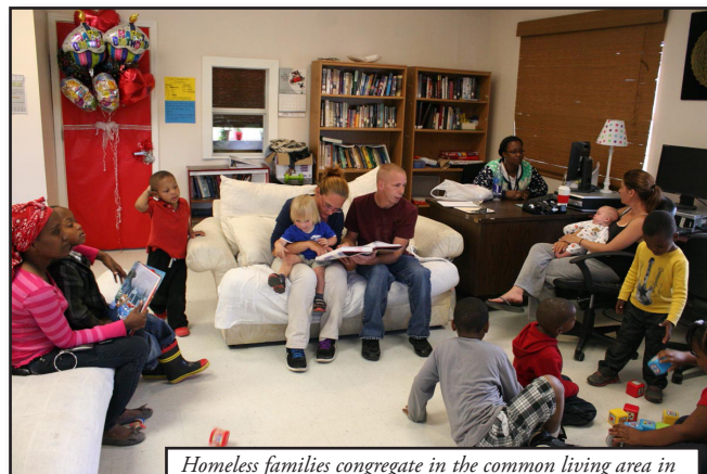
Homeless families congregate in the common living area in the evening and spend time together before bedtime.