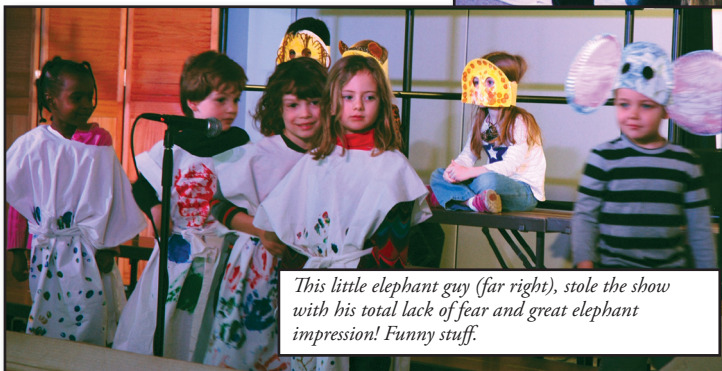
This little elephant guy (far right), stole the show with his total lack of fear and great elephant impression! Funny stuff.

The preschool kids put on a great show for their dad's at the Dad's Breakfast. Using the theme of Noah's Ark, the kids portrayed the animals on the ark - each group with a different song, a dance, or some just made funny sounds. So cute!