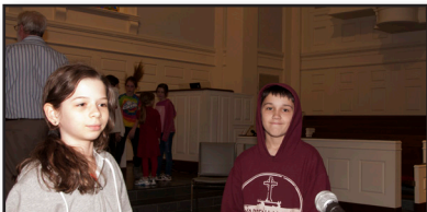
These two NETkids have the roles of Joseph and Mary in "The Lost Boy."