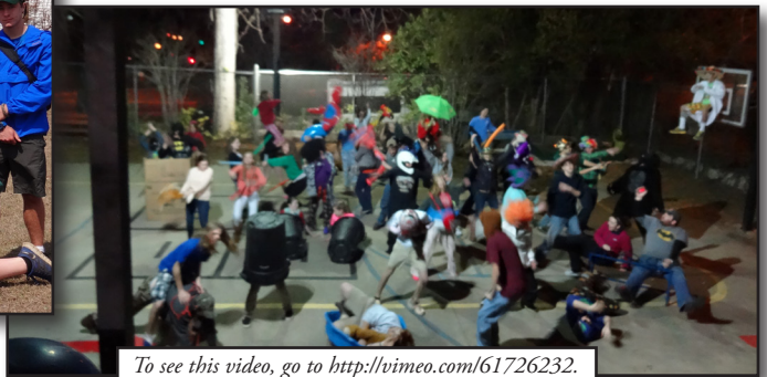
To see this video, go to http://vimeo.com/61726232 .