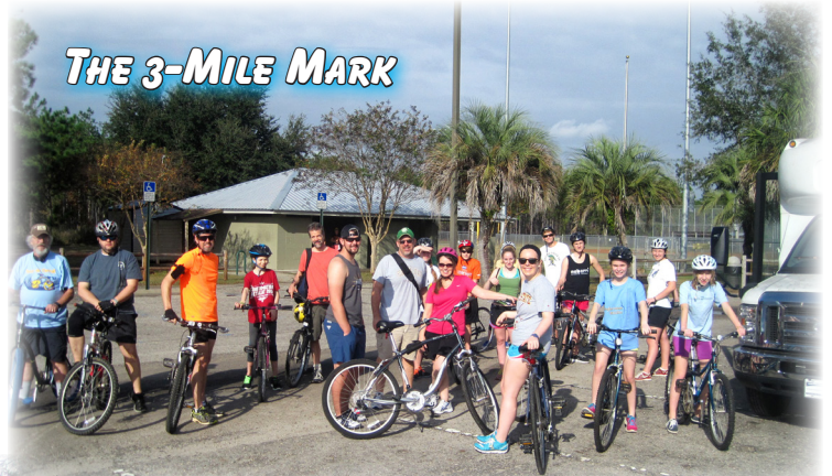
THE 3-MILE MARK