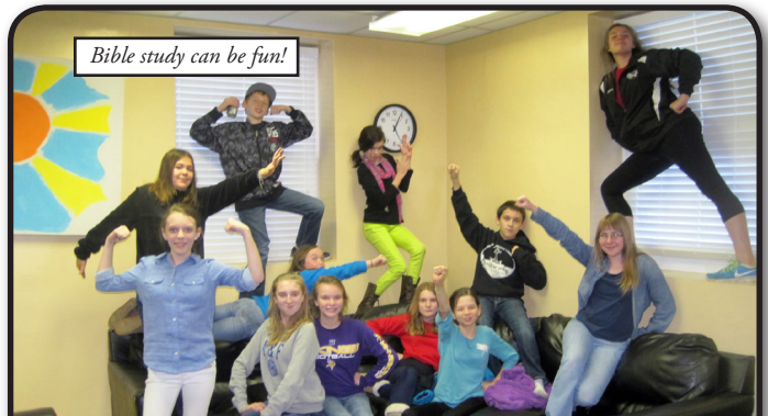
MID-HIGH BIBLE STUDY