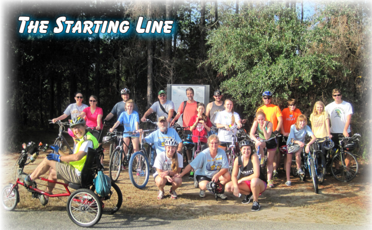
THE STARTING LINE