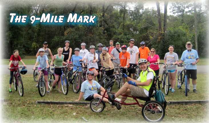
THE 9-MILE MARK