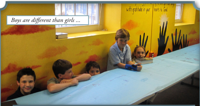
2014 Confirmation Class