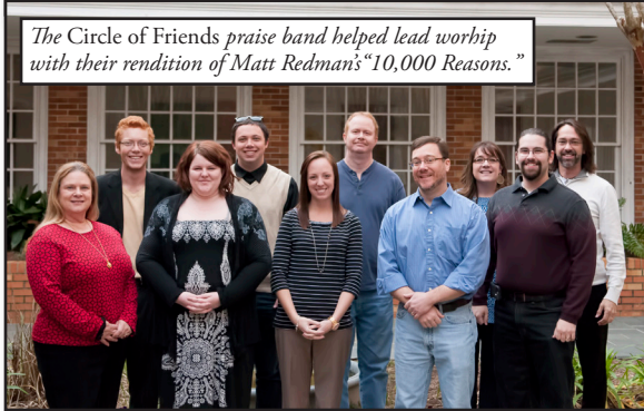
The Circle of Friends praise band helped lead worship with their rendition of Matt Redman's "10,000 Reasons."