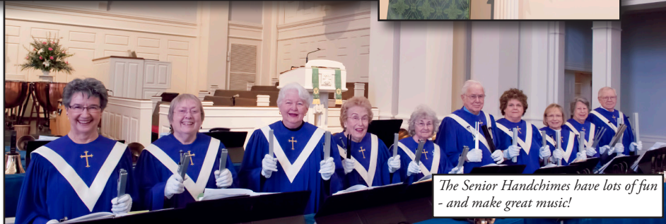
The Senior Handchimes have lots of fun - and make great music!