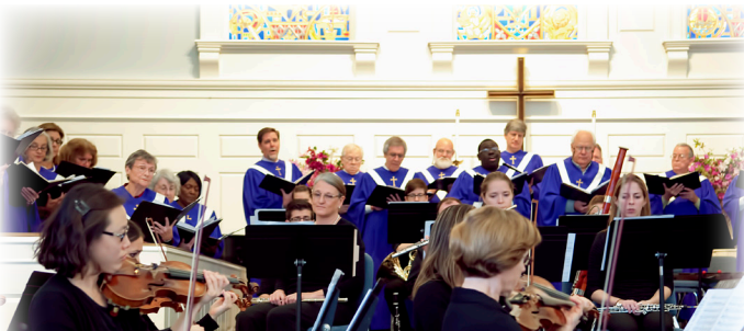
In the photo above, a few of the 22-piece orchestra perform during the special Sunday service featuring the music of John Rutter.

Both pans groups performed on our church steps during Springtime Tallahassee. You can now see us on YouTube by going to the Trinity website ( www.tumct.org ) and clicking on the slideshow on the entry page.