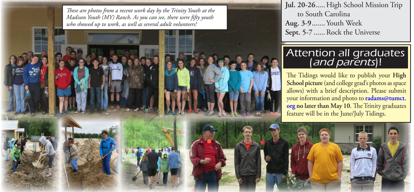
These are photos from a recent work day by the Trinity Youth at the Madison Youth (MY) Ranch. As you can see, there were fifty youth who showed up to work, as well as several adult volunteers!

this great church for the last 10 years. I can't even begin to tell you how much you all mean to me, how much I have grown as a Christian, and how much I will miss calling Trinity my church home. Trinity ... you are amazing and I love you all. Goodbye for now.