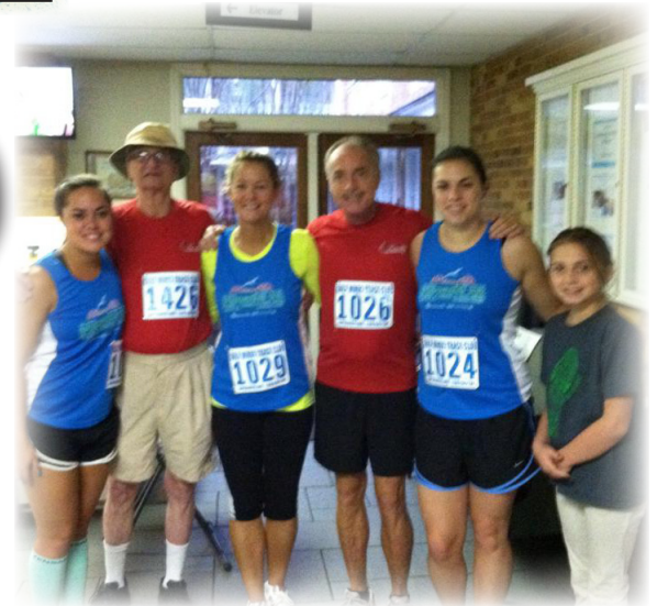
What rain? This is the group that decided rain was the perfect environment in which to exercise at Springtime Tallahassee!