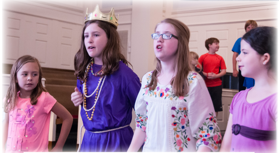
In the photos above and below, NETkids practice for the musical, "Faith Hall of Fame."