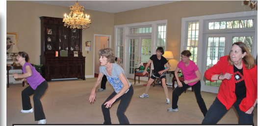
The “Variety Mix” class, shown here, meets on Tuesdays and Thursdays at 11 a.m. This is an energetic class that will get your heart pumping.