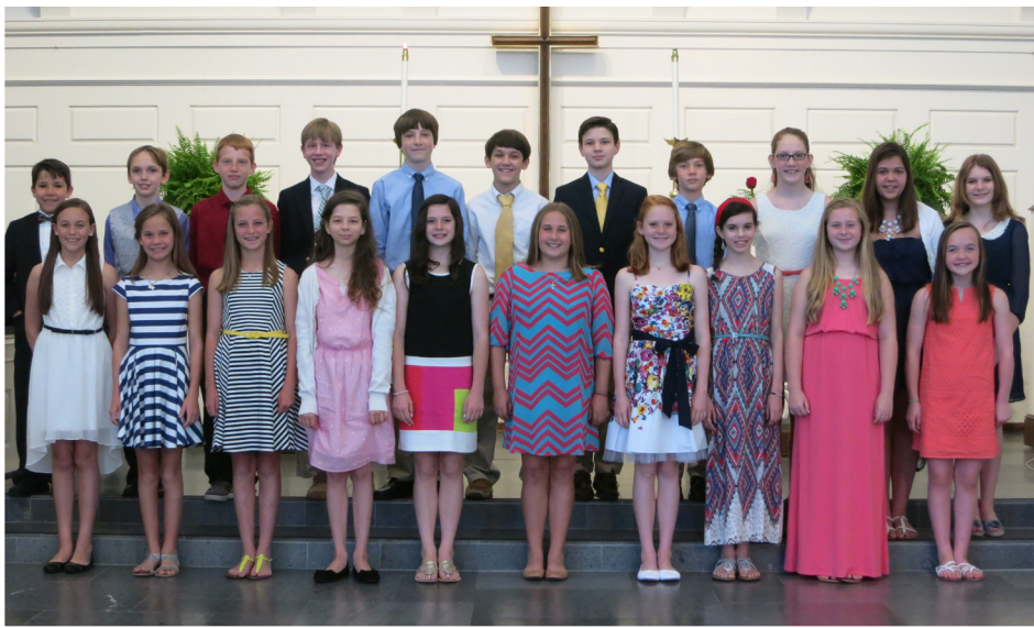
Above, the 2014 Confirmation class poses for a pre-service photo. What a great class - 21 new members! Below, the 2014 graduating seniors were honored during a special service.