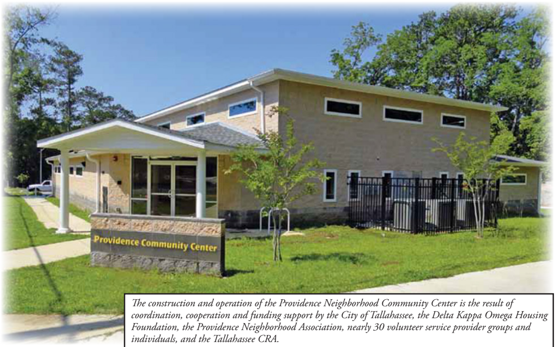
The construction and operation of the Providence Neighborhood Community Center is the result of coordination, cooperation and funding support by the City of Tallahassee, the Delta Kappa Omega Housing Foundation, the Providence Neighborhood Association, nearly 30 volunteer service provider groups and individuals, and the Tallahassee CRA.

Is it Trinity's providence to serve Providence Neighborhood?