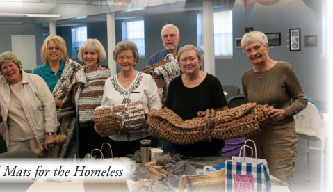
Hats and Mats for the Homeless