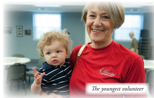
The youngest volunteer