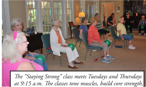
The “Staying Strong” class meets Tuesdays and Thursdays at 9:15 a.m. The classes tone muscles, build core strength, and improve balance.