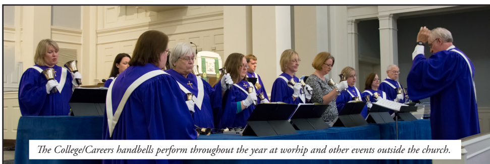
The College/Careers handbells perform throughout the year at worship and other events outside the church.

The annual Trinity Preschool Christmas program is set for Friday, December 19 at 11:30 am in Moor Hall. This is always a well-attended event!