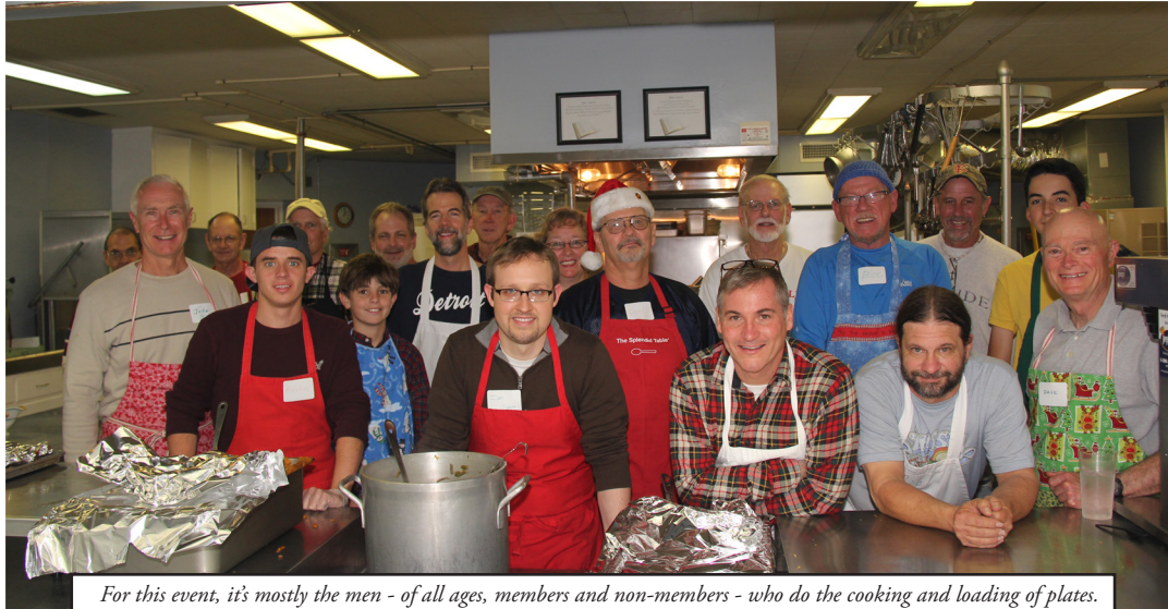
For this event, it's mostly the men - of all ages, members and non-members - who do the cooking and loading of plates.

We would be remiss if we didn't acknowledge and thank organizations and businesses that have in the past and continue to contribute to the dinner: Tasty Pastry Bakery, Pepsi Cola, Flowers Bakery, Saint Paul's United Methodist Church, Killarn United Methodist Church, First Presbyterian Church, Quality Snacks.