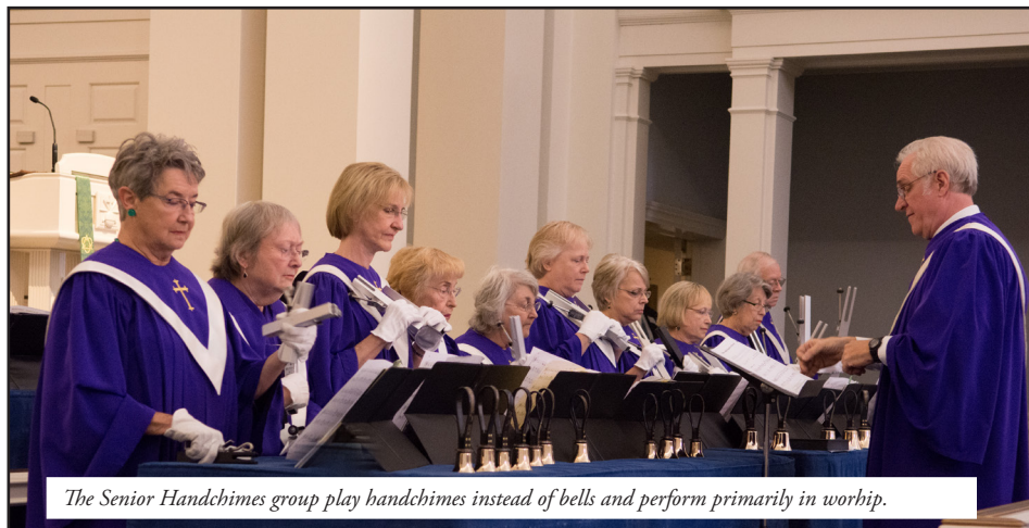
The Senior Handchimes group play handchimes instead of bells and perform primarily in worship.

of the CD's distributed. Well, as a gift to our congregation, musicians at Trinity are preparing for an Advent/Christmas CD to be available about this time next year. We will be giving these out free to anyone who wants one until we run out! Catch is, we need to record the music this Christmas season even though the CD will not be available until next Christmas season.