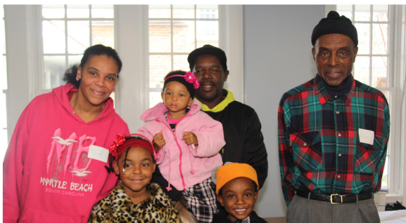
Some families come every year and make this an opportunity to spend time with extended family.

While the dinner is being served, there will be a carol sing as visitors and volunteers join the musicians who serenade us until closing time. You don't have to have any special musical talent to join the singers, just sing along for the pure joy of it. For three years in a row now, we've been blessed to have Trinity's Hats for the Homeless Ministry join in the dinner. They bring knitted and crocheted hats and scarves of all sizes and descriptions for men, women and children. It's fun to watch as people look for just the right hat or scarf that suits them.