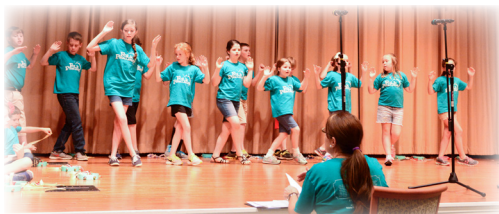
The NETkids perform several times each year.

You can join many of Trinity's music groups by coming to one of our rehearsals. That is true of Chancel Choir , Youth Choir , and our two NETkids Choirs . Other groups require some music background, especially the ability to read music. To join these groups, you should contact the leader of each