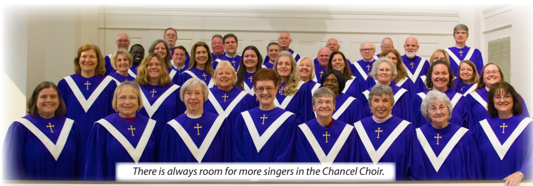
There is always room for more singers in the Chancel Choir.

Last but not least, the Chancel Choir returns to the choir loft on August 30 . We really miss their leadership during their summer break and look forward to another great year of music making with this wonderful group of dedicated musicians.