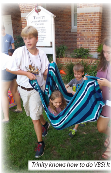
Trinity knows how to do VBS! It helps when there are lots of willing youth volunteers - and lots of enthusiastic kids!