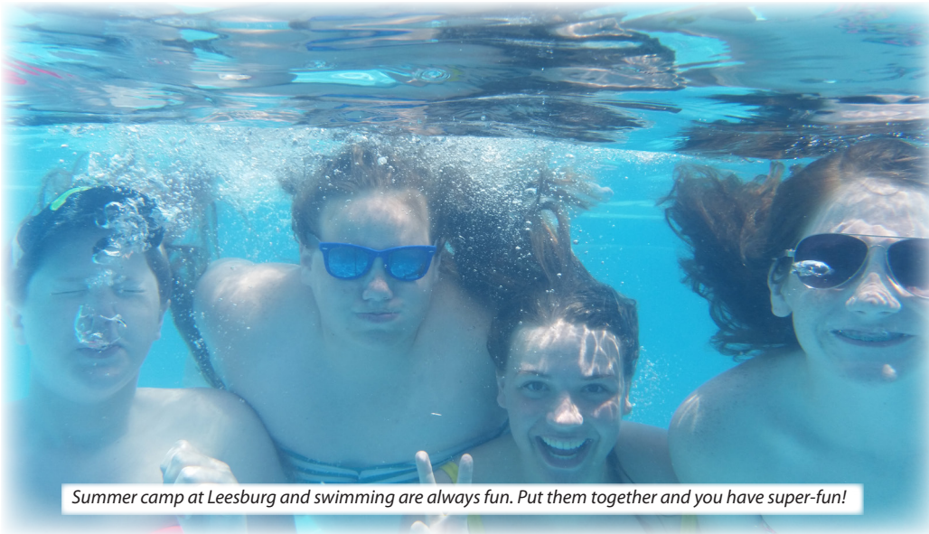
Summer camp at Leesburg and swimming are always fun. Put them together and you have super-fun!

We would specifically like to invite you to join us on Sunday, August 16th for Youth Sunday. It is a great way to see many of our students sharing their gifts and talents. Thank you again for all that you do to support our youth!