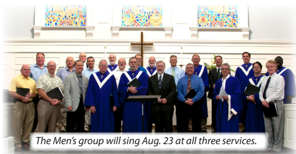
The Men's group will sing Aug. 23 at all three services.

Our two steel pan groups have not played at 8:30 and 11:00 a.m. services at Trinity since Music Ministry Sunday, February 1. Since then, they have presented music elsewhere, but not in our sanctuary. Good news; they will both participate in worship services on August 9!