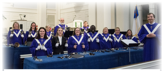
The Jubilation Bells are a favorite on Music Ministry Sunday.