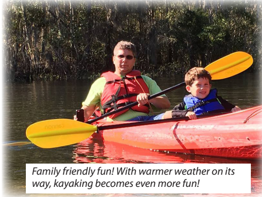
Family friendly fun! With warmer weather on its way, kayaking becomes even more fun!