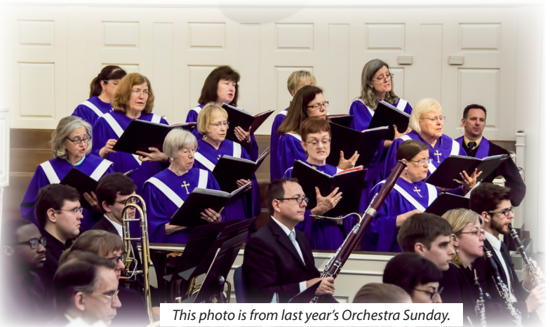
This photo is from last year's Orchestra Sunday.

be your music ministers for that morning! Families with young children; if you are not involved in NETkids, this is an excellent opportunity for you and your children to see and hear what our children are up to in this wonderful Wednesday afternoon ministry. So for everyone: Come for the Bible stories and new insights. Enjoy watching Trinity's children as they learn how to be worship leaders!