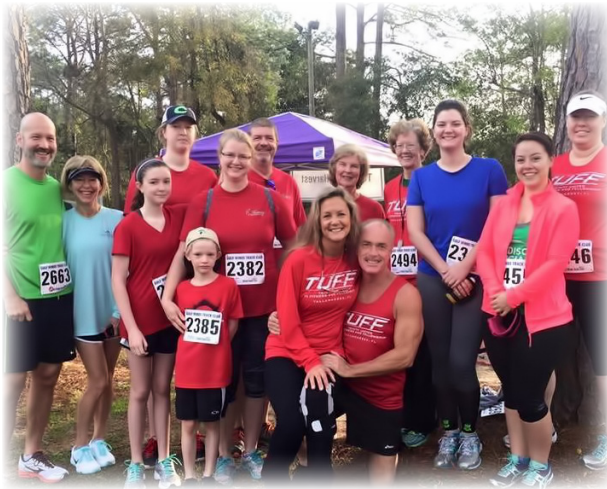
Pictured here are part of the TUFF team (there were over 30!) who won $500 for missions at the Shamrock Scurry on Saturday, March 12. They have won four years now for having the most participants from a church. Congrats TUFF Team!