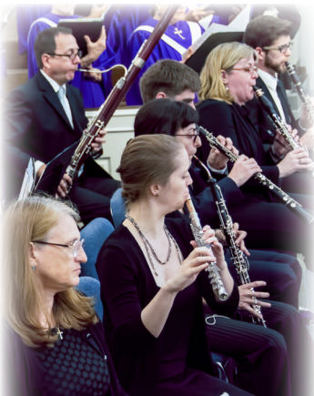
There are many classically trained musicians who play with the orchestra.