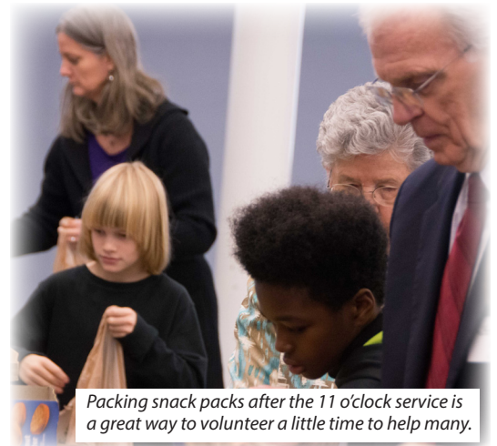
Packing snack packs after the 11 o'clock service is a great way to volunteer a little time to help many.