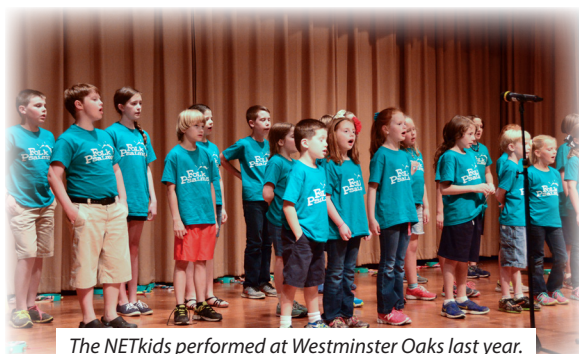
The NETkids performed at Westminster Oaks last year.