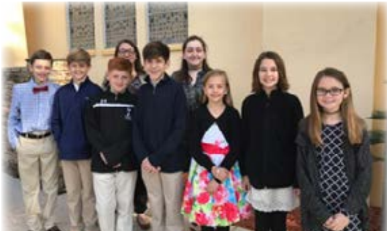
The Confirmation Class visited the Co-Cathedral of St. Thomas More recently.

on our second confirmation field trip and learned a bit about Catholicism.