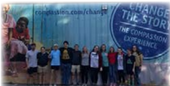
The Youth visited the "Compassion Experience."

Sunday, May 21: Graduate Sunday (Seniors Recognition)