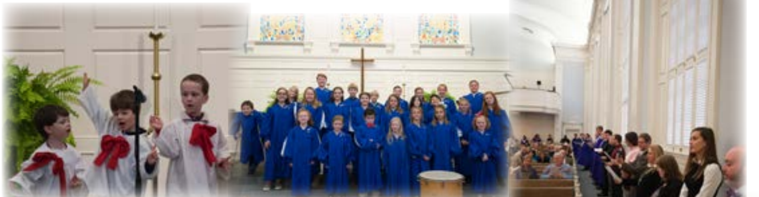
Clockwise from top left, the Cherub choir was small but mighty! The NETkids choirs were excited to help lead worship. For the final hymn, the musicians surrounded the congregation. Who knew Trinity had so many talented orchestral musicians? Just wow! They sounded great!

One Sunday each year, our Chancel Choir has the rare opportunity of singing with a professional orchestra. We select a theme for the service based on a favorite hymn. This year, our hymn is "Amazing Grace". Come Sunday, April 2 to the 11 am service. We hope to have 40 singers and a 25-plus member orchestra. How often do you see a bagpiper and harp at a worship service, along with a full orchestra? Come, Sunday April 2. Titles of our selections: "Amazing Grace", "Bound for the Promised Land", "How Firm a Foundation", "Make Me an Instrument" and "My Song in the Night." Something unique will happen to another hymn we will all sing that morning, "Swing Low, Sweet Chariot." Shhh, it's a secret!