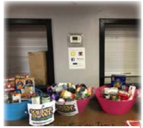
Second Harvest benefited from the the food and money raised from Souper Bowl of Caring!

Please pray during March for the many upcoming events headed our way, and come get involved! Our Spaghetti Dinner at