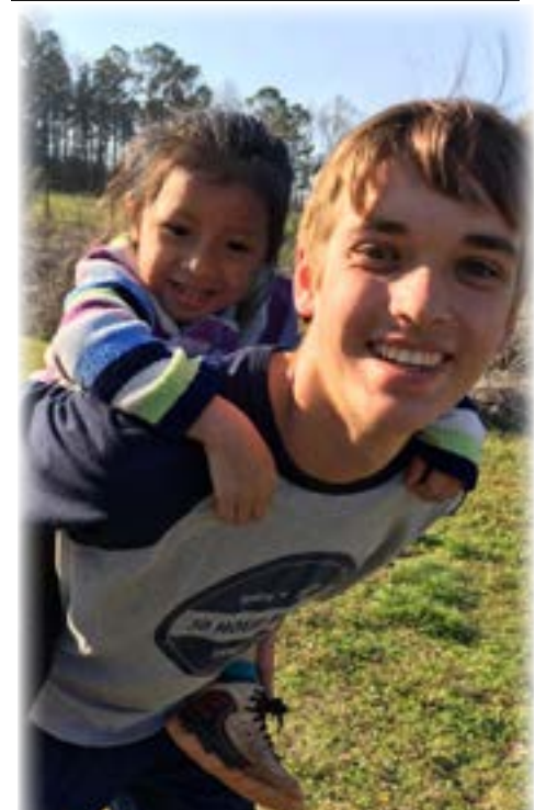
Part of going on mission is making new friends.