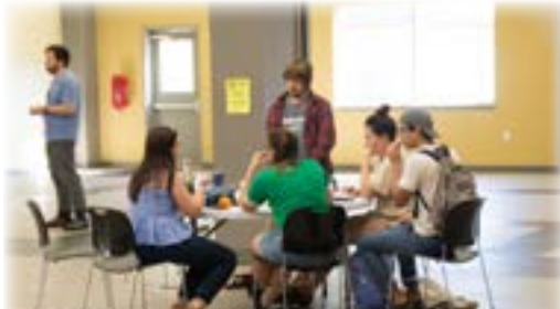
Lunch is a time for staff and students to gather in the large common area

I know the local missions team at Trinity is proud of our connection with the TCC/FSU Wesley Foundation and their accomplishments. We will continue to support and give financially to this vital ministry as they continue to dream about their own future and the ways that they can share the gospel with college students. If you are