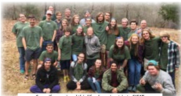
Sorry if you missed this life-changing trip to SIFAT.