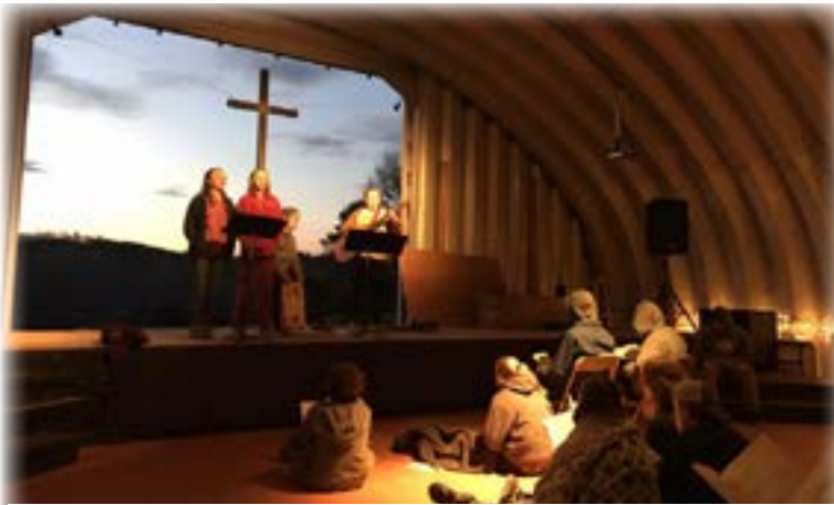
The Youth Praise Band led worship in the evening at SIFAT.

Everything "youth" is moving right along and we want to thank everyone in advance who will be joining us for our annual Springtime Tallahassee Spaghetti Lunch . We will be serving lunch from 11 a.m.-2 p.m. on Saturday, April 1 and as always, with every lunch ticket purchased you also receive a parking spot (as they are available) in the Trinity parking lot. Tickets are $5 for adults and $3 for children. We hope to see you out there! These earnings