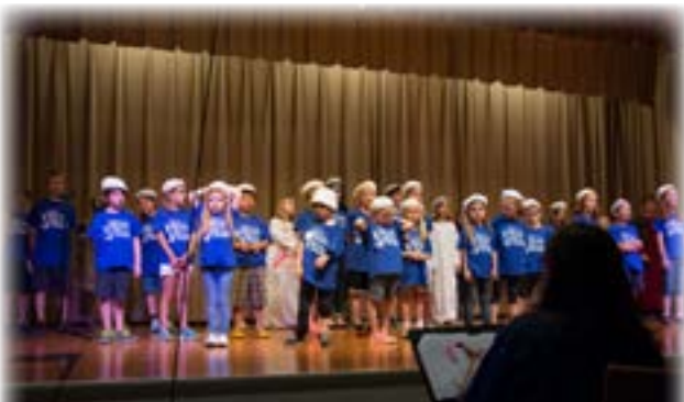
The NETkids are shown here performing "The Sailor's Bible" at Westminster Oaks retirement home.