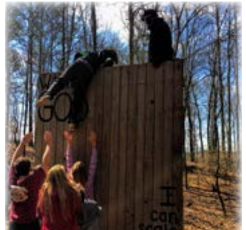
Working together to get each other over the wall.