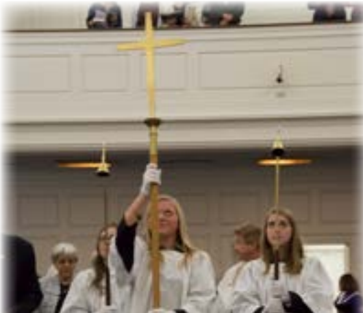
Trinity youth have embraced the the roles of crucifer and acolytes.

Trinity is a great place for young children. They have lots of opportunities to grow in their faith, and our Wednesday afternoon NETkids ministry is one of the best! If you have children who are attending kindergarten through 5th grade who have not tried NETkids, please consider bringing them to one of the services April 30. I encourage the whole congregation to invite friends and neighbors with children to attend with you that day! Everyone will see what a wonderful, vibrant church we have, and that we value our children. Thank you Trinity, for helping our young children learn more about their faith and allowing them to share with the congregation in so many ways.