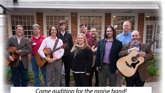
Come audition for the praise band!

( sesquialt@embarqmail.com ). If you have questions about any of our music groups, I am happy to help. Watch for additional information in our church bulletins and in the September Tidings. The main thing: we want you to COME JOIN US!