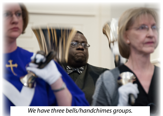
We have three bells/handchimes groups.