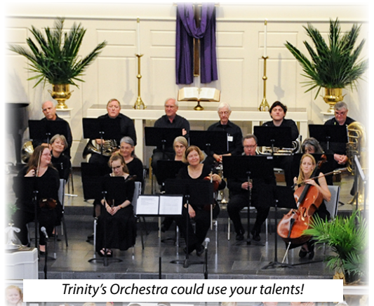
Trinity's Orchestra could use your talents!