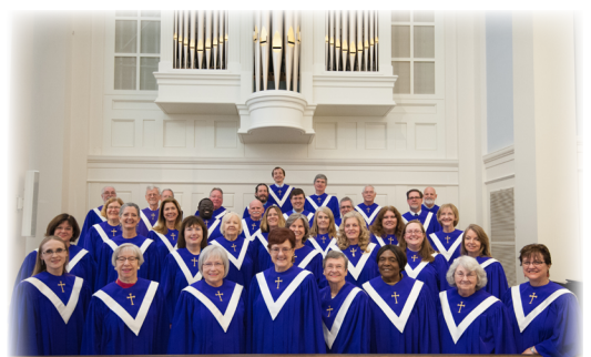
The 45-member Chancel Choir.