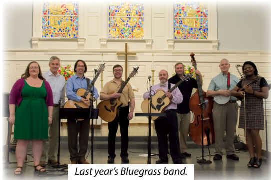
Last year's Bluegrass band.

Bluegrass Sunday is set for August 20. This is always a great day or worship for all