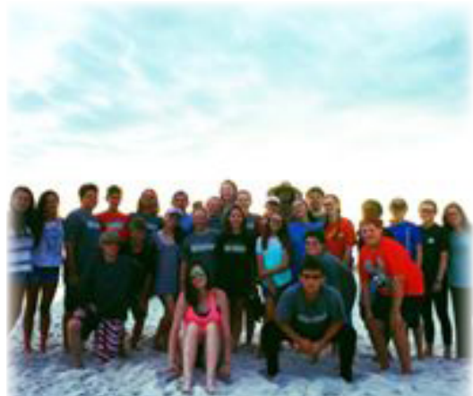
Youth Week was capped off with a trip to Laguna Beach!

Sunday morning after VBS, we took our mid highs off to Vero Beach for their mission trip at EPIC (Embracing People In Christ). There our youth worked tirelessly throughout the community helping those in need and building relationships with complete strangers. Their servant