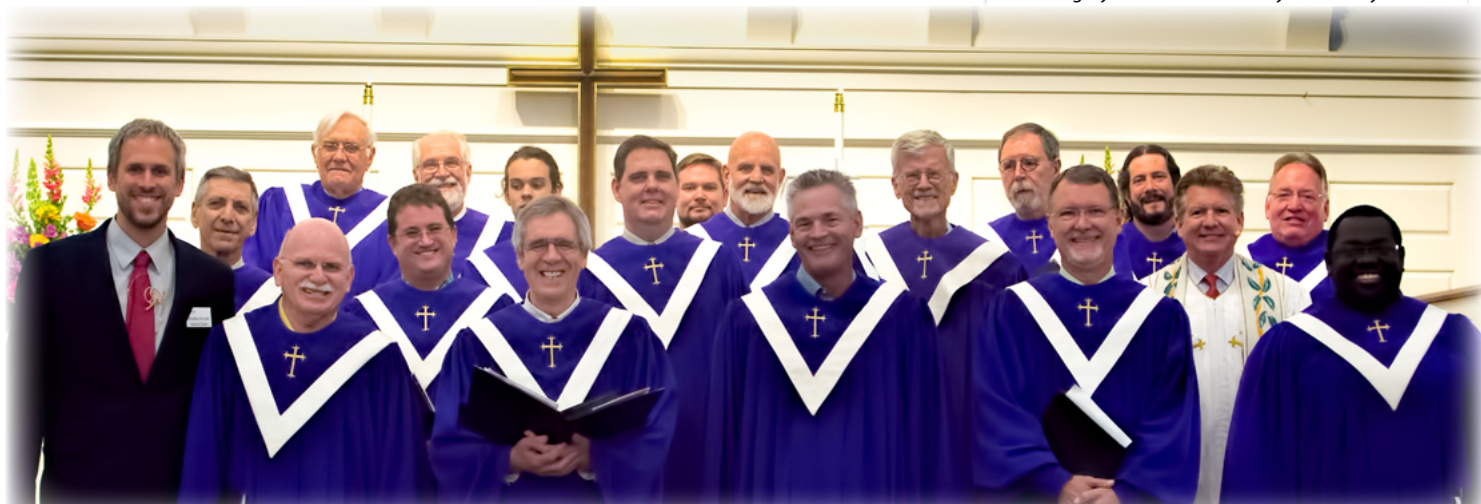
The Men's Ensemble has been a welcome addition to the music program when they sing.