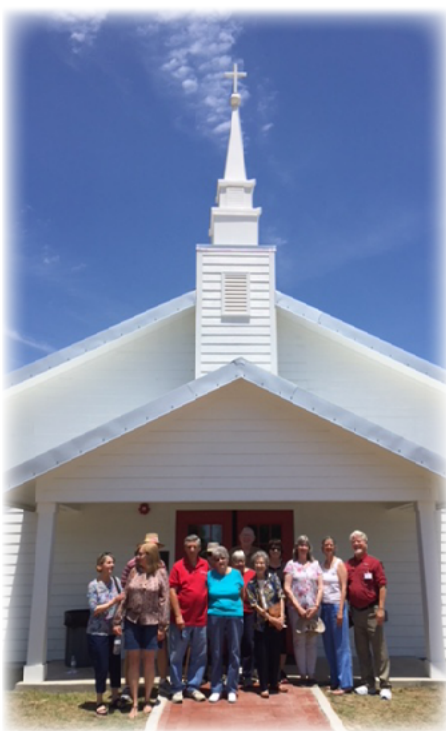
Trinity was well represented at the Madison Youth Ranch for the dedication of the chapel and counseling center.