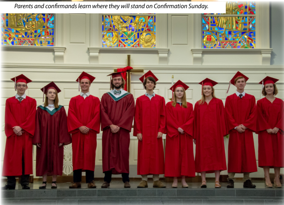
This year's graduating class included two National Honor Society members. Congratulations graduates!

Jun. 22-26 .....Orlando mid high mission trip