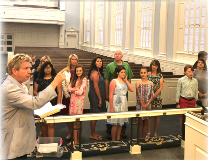
Parents and confirmands learn where they will stand on Confirmation Sunday.