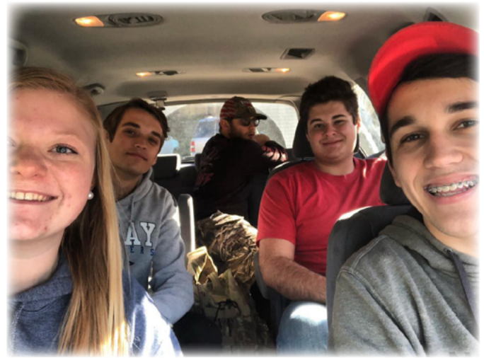
The upperclassmen recently visited the Warren Willis camp for College Connection .

We're busy preparing for our high school mission trip to North Carolina in March and are so grateful for your support leading up to this big event! We look forward to sharing all we learn there and the work we'll be able to do there as the hands and feet of Jesus. Thanks always for all you do to support and promote our terrific youth group. We are endlessly grateful!