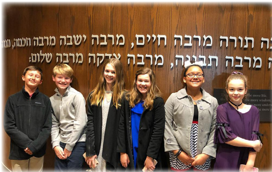
The Trinity confirmation class visited the synagogue at Temple Israel as part of their confirmation process.