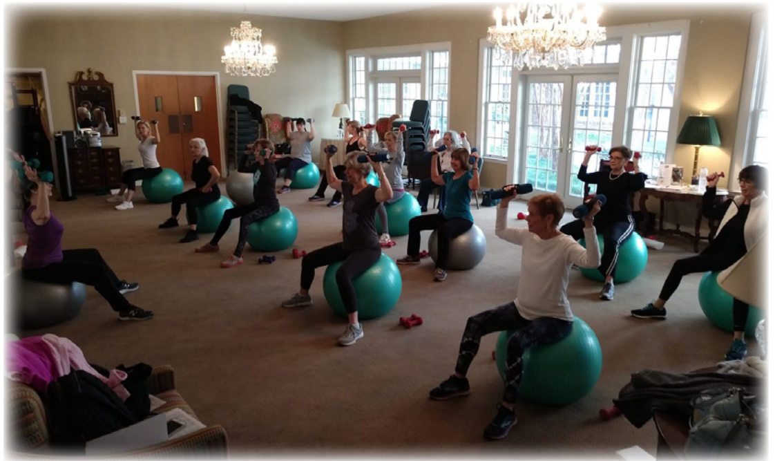
Variety Mix starts the BFC Challenge on Jan 8, 2019! Come join us!