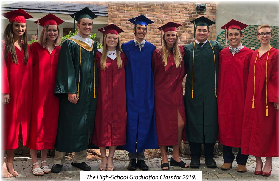
The High-School Graduation Class for 2019.

for their huge accomplishments on Graduation Sunday and all the while we have been busy preparing for Youth Week, VBS, and our fun trip to Wild Adventures to celebrate all our acolytes and youth choir members' hard work and dedication this past school year! All of these students made me (and their church family at large) so very proud! Sometimes the Lord blesses us so completely as we are in the midst of trying to be a blessing to others!