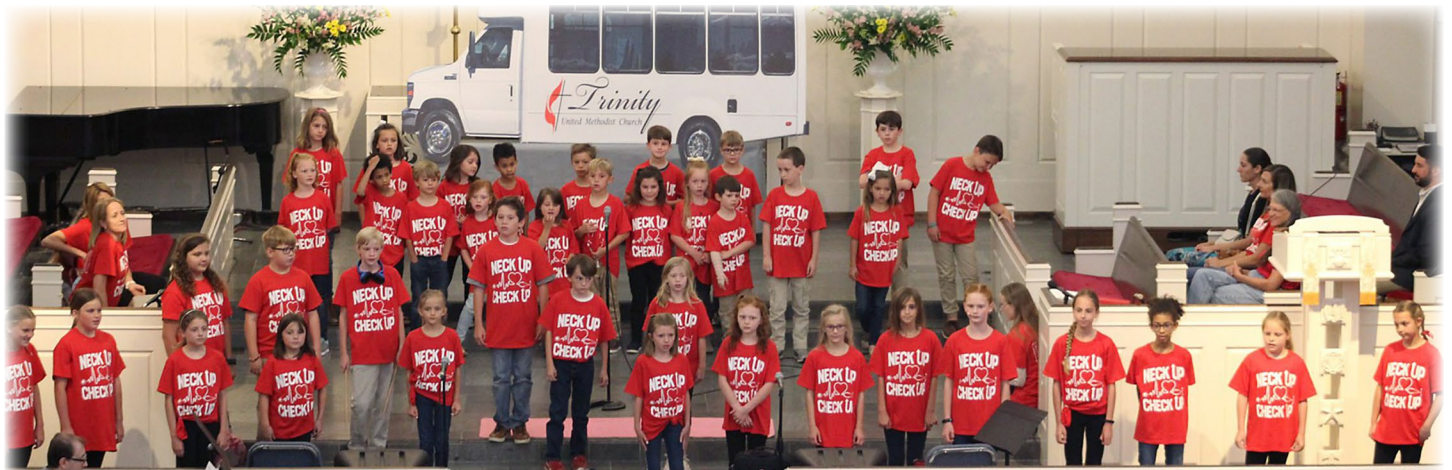
The NETkids performed their musical, "Head-Up Check-Up" for the Trinity congregation, and then went on the road to present it to the residents of Mulligan Place.