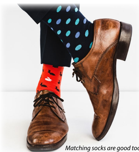
Matching socks are good too!

Just think how good a clean, dry pair of socks feels when you've been walking a long distance and your feet are hot and