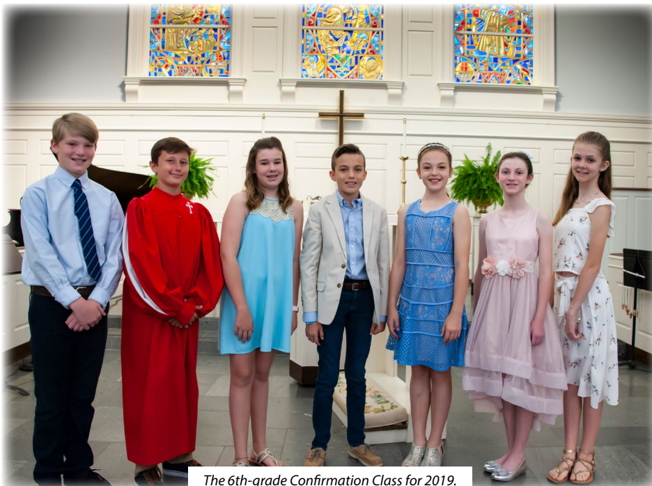
The 6th-grade Confirmation Class for 2019.