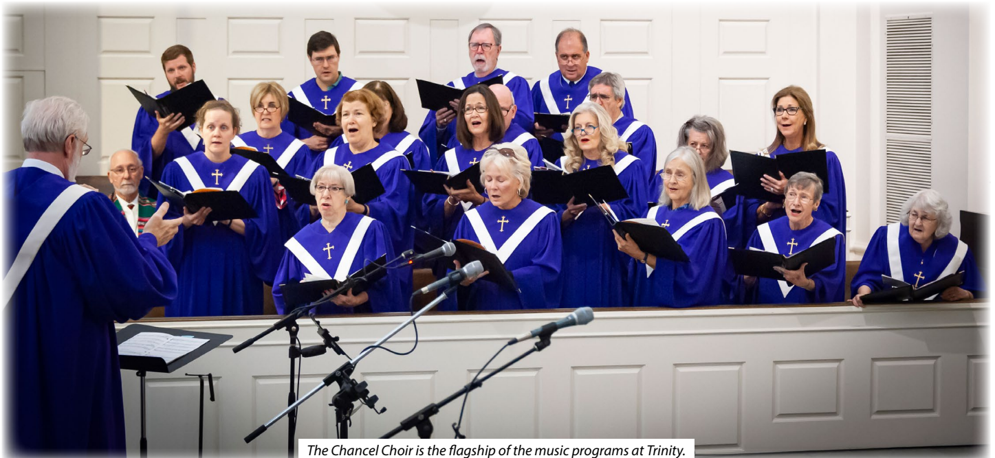
The Chancel Choir is the flagship of the music programs at Trinity.