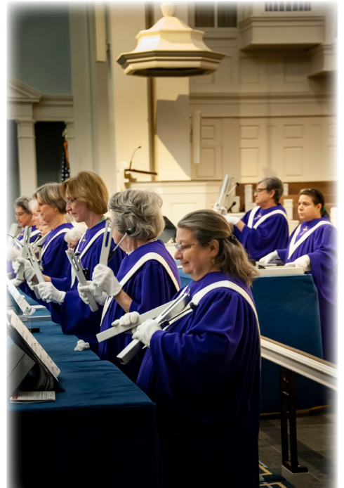
Heavenly Handchimes perform at a recent service.

Each fall, a luncheon is held after the 11 a.m. service honoring our Chancel Choir. It is one way the church says "thank you" to the choir for its dedicated service week after week. These musicians are indeed worship leaders every time they sing. Their goal is to enhance the worship service and bring people closer to God. This event takes place Sunday, November 3 in Moor Hall and is always well attended.