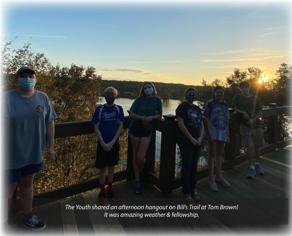
The Youth shared an afternoon hangout on Bill's Trail at Tom Brown! It was amazing weather & fellowship.