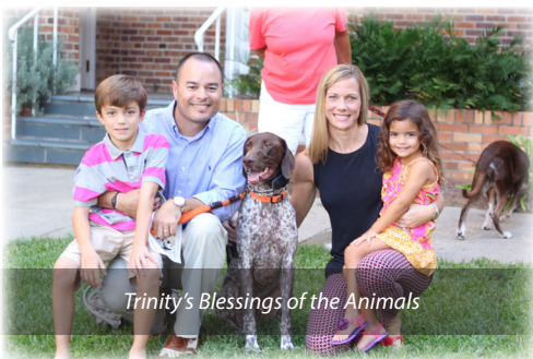
Trinity's Blessings of the Animals