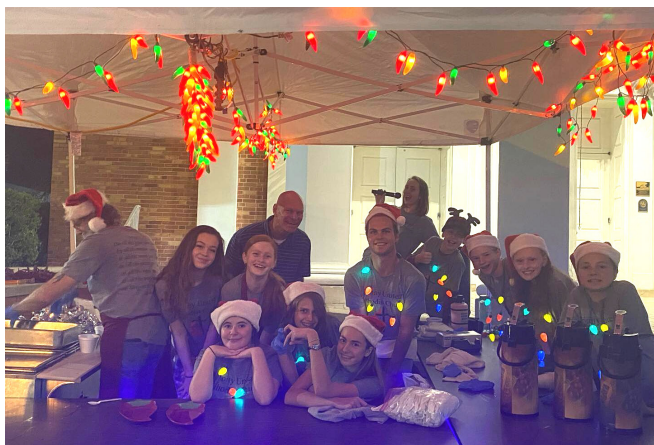
Chili Fundraiser Tent

As we kick off another New Year down here in the Underground, I first want to thank everyone who helped us during the month of December. December was a very busy month for our youth including fundraisers and several Christmas events. Our youth have worked hard to raise over $4,700 toward mission trips this summer and are off to a great start! The youth and I would like to personally thank everyone who helped out during these events and for everyone who came out to support us. Whether you bought a tree or a wreath, a steaming hot bowl of chili at our Chili Dinner during the Festival of Lights, or you were here during one of our many Sunday morning or Sunday evening activities, we are grateful. We literally couldn't have done it without you! So THANK YOU!