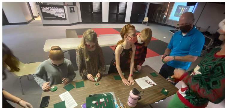
Making Advent Wreaths in Sunday School