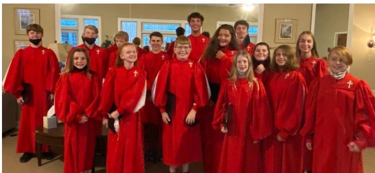
Acolytes at the Hanging of the Greens Service, Dec. 5

Check out the Youth website for more information