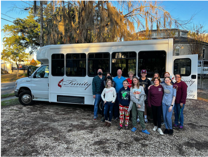
Youth Heading to Rock the Universe in Orlando

After a wonderful cold and rainy February, your Trinity youth are ready for some springtime. The Youth doors have been wide open for a year now, and we're cautiously optimistic as we move forward. As I write this article, the youth and I have just returned from a fantastic trip to Orlando for a wonderful time of worship and fellowship at Rock the Universe. I confess to having been anxious being in such crowds of people, and I spent a lot of time talking to God about making that trip. We stepped out in faith and were blessed by it.