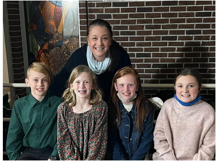
Confirmand Field Trip to Temple Israel

The confirmation class has been busy these past few months as well. We took a field trip to Temple Israel at the end of January. That evening we shared a meal, attended a service together, and had a time of Q & A after with the Rabbi. In February we visited St. Thomas More on our second confirmation field trip and learned a bit about Catholicism. We're having a great time learning how different denominations do things and why. This month we'll head to Warren Willis for our annual Confirmation Retreat, and I can't wait! This is a terrific time of growth for our confirmands, and I love being able to watch.