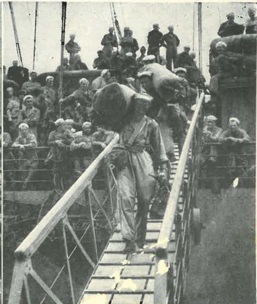
No. 1625 Seabees at Sea and at Disembarkation Point, Greetings from ( )ary, Va.